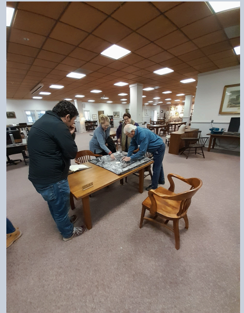
Library staff from the University of Lynchburg (above) and Campbell County Public Library (below) use the collections during research visits in March and August. The library offers targeted tours for professionals at area institutions who work with researchers.